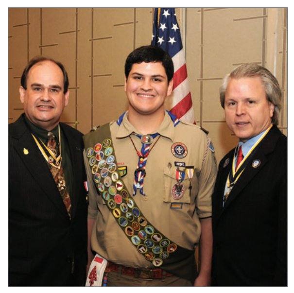
2013 Eagle Scout Contest Winner