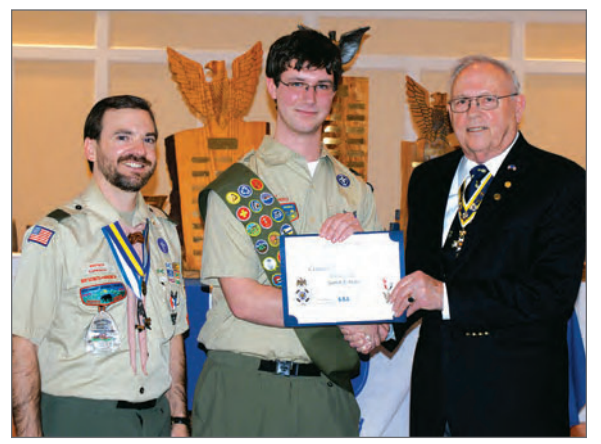
Eagle Scout Court of Honor recognition by the Sons of the American Revolution.

The SAR and the Boy Scouts participate in many activities together. Scouts of all ages can help during SAR parades and ceremonies including grave markings and Revolutionary War battle ceremonies. SAR members contribute to Scouting activities by teaching relevant merit badges, such as American Heritage, Genealogy, Law, Citizenship in the Community, Citizenship in the Nation, and Citizenship in the World.